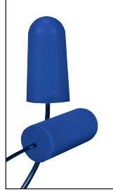
267-HPF210D METAL DETECTABLE